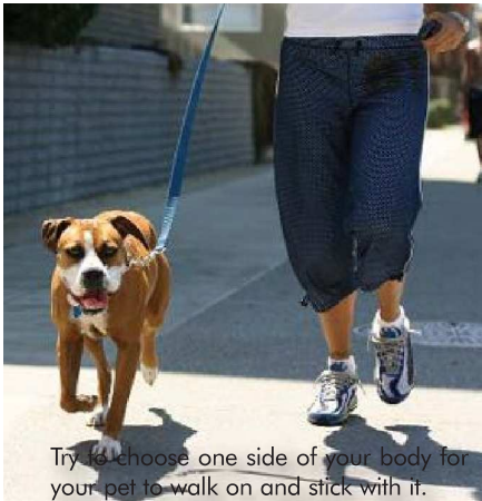
Try to choose one side of your body for your pet to walk on and stick with it.

Many of us have already been utilising treats, hand signals, and our voice to lure our pet into desired obedience commands. I would like to also recommend integrating quite a bit of handling and touch while teaching your dog these obedience positions. If you are already training your dog the "Settle" or "Relax," your pup is likely offering all three of these positions during your training sessions. Try to start saying the command for each position as your dog adopts it in his training so that you can capture and reward the appropriate position.