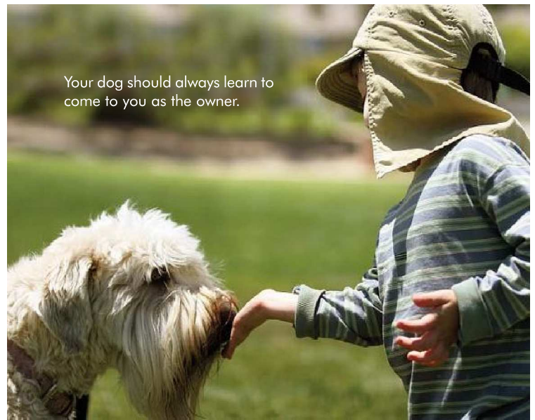
Your dog should always learn to come to you as the owner.

COME WHEN CALLED The recall or "Come when called" exercise should be a good association for your dog. Coming to you must not necessarily mean the end of playtime. Your dog should always learn to come to you as the owner. Refrain from reaching out to your dog and physically pulling him in. Touch the collar once your dog is in close, praise, and feed him a treat (if desired) at the same time. Then release your dog back into play.